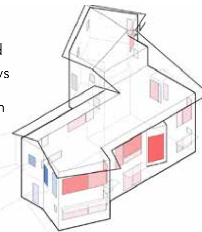
WINDOW HEAT GAINS/LOSSES: SUMMER